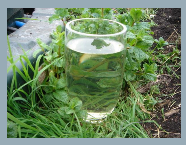
Effluent sample from a BioKube sewage treatment plant